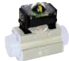
Limit switch box