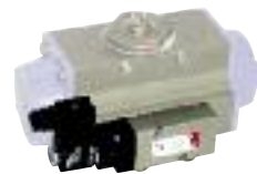
NAMUR solenoid valves

Please refer to 'Accessories' page 085 - 089